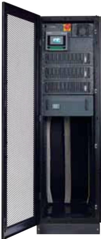
Example of integration (3x25 kW).

Only 15 U of rack space occupied: space-saving design leaving free space for other rack-mounted devices. One empty slot in the MODULYS RM GP sub-rack remains available for power upgrade or redundancy.