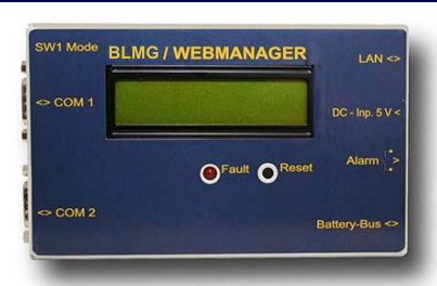
The BLMG WEBMANAGER manages up to 190 batteries, a UPS and 8 additional environmental sensors simultaneously