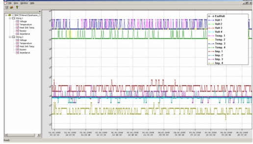
BLMG battery analysis for 4 accumulators in the BLMG VIEWER. Each change in impedance, temperature, voltage and bypass is recorded every 30 seconds.